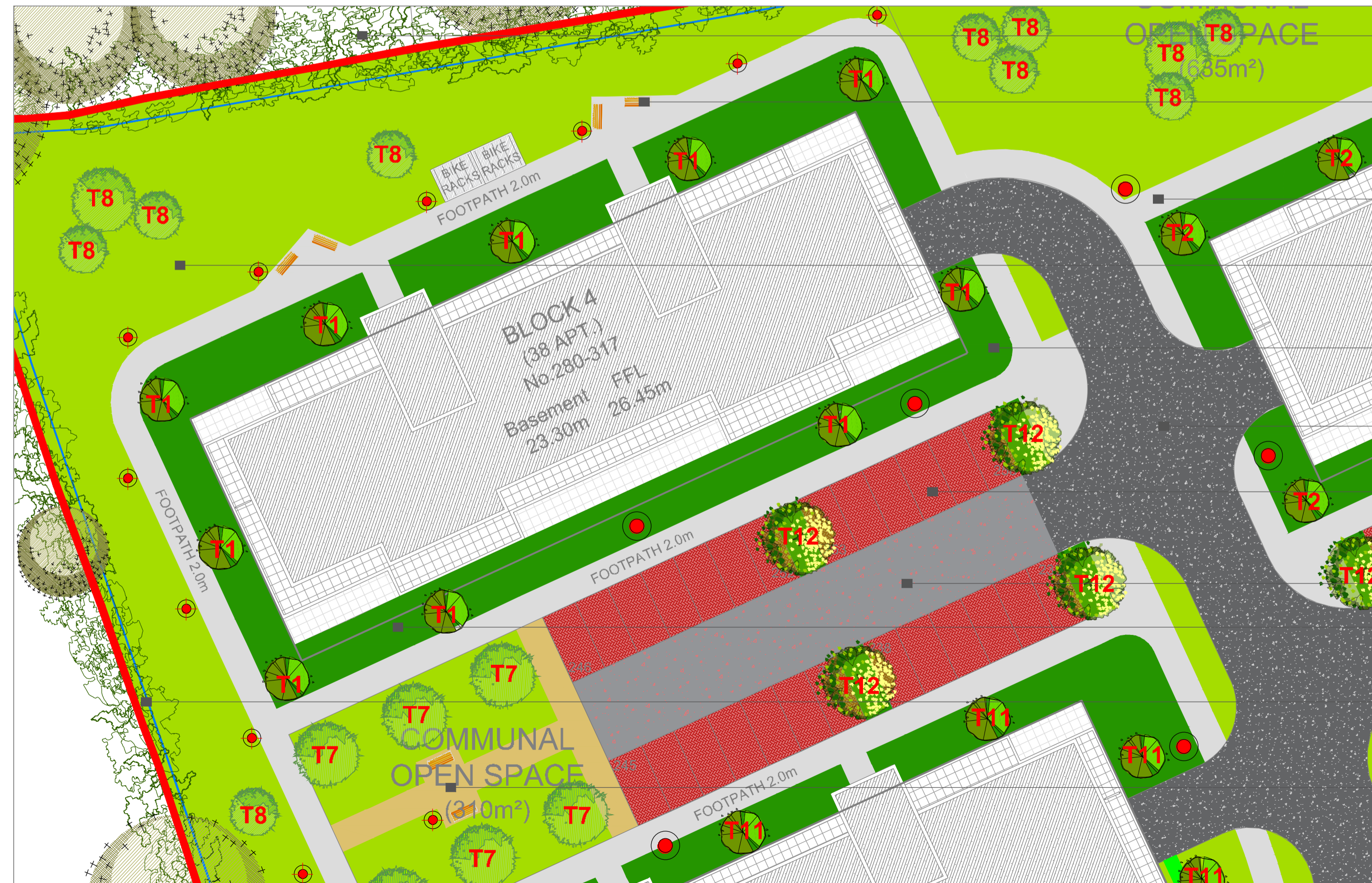
Apartment Blocks & Surrounding Space Detail - 1:250