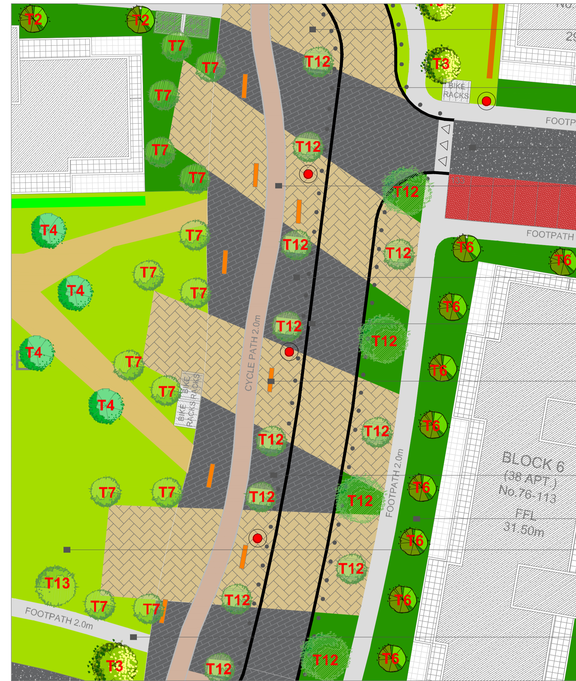
Civic Space Detail - 1:250